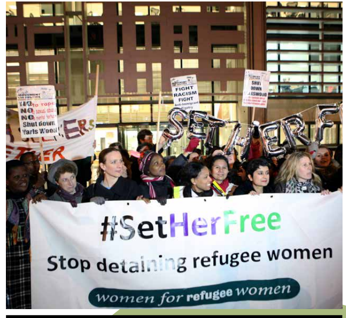
World festival at the Royal Festival Hall, March 2014.

We want to see an end to detention, and we hope you will join us